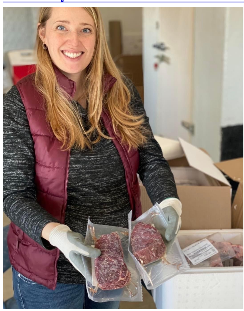
T-A FAMILY PREMIUM MEATS