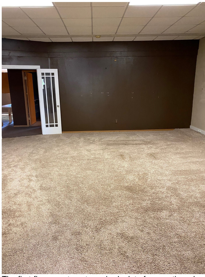
The first-floor apartment required a lot of renovating when it was first purchased by T-A Family Premium Meats.

The Troesters expect an increase in customers, sales and net profits due to the new store front, increased offerings and tourist traffic in Marquette. This project will support T-A Family Premium Meats' goal to provide quality products and convenience – with a story – to their consumers.