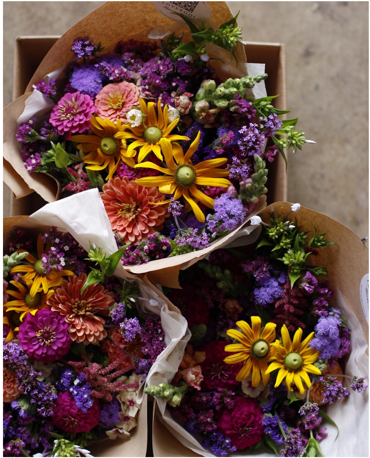
Pictured are bouquets produced from the 2022 season when Clovergold Flower Farm received 4" of rain for the entire growing season.